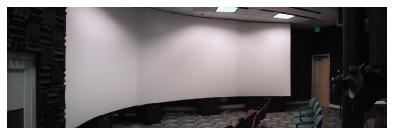
Figure 3. ICT Virtual Reality Theater

storytelling techniques. This technique is used to create content dynamically and fit to the changing needs of the visiting audience.