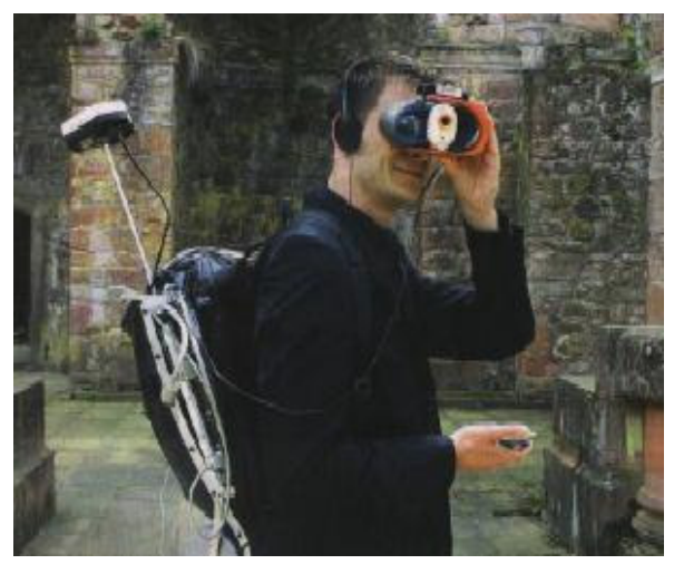
Figure 2. "GEIST"-equipment

In [SGBI02] a multi-level concept that can be used to explore interactive storytelling at varying degrees of flexibility versus predetermination is presented. Instead of an ultimate virtual narrator it is suggested to develop layers of run-time engines that allow authors to work with directions on each layer separately. The goal is to preserve the human author's authority in story creation. An example that is given is the "GEIST-project", which is a project to make use of interactive storytelling during a real city tour. On the actual location of the sight tourist are helped by ghosts, which appear and communicate with the tourist if they reach a certain location. With special equipment (see Figure 2) it is possible to see those ghosts. It is also possible with the use of the equipment to see how sites looked in the old times by recreating them virtually [KSS01].